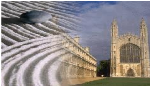
Fig-4 Wipe effect

4) Wipe - Wipes are dynamic kind of transition. When one shot pushes the other off frame, then wipe takes place.