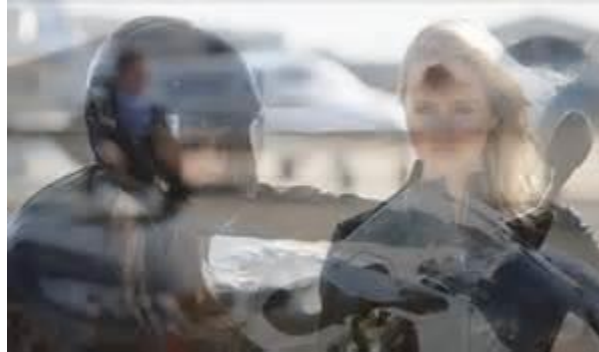
Fig3: Dissolve effect

3) Dissolve - It is also known as overlapping. Dissolve occurs when there is replacement of one shot with the next gradually. One shot disappears as the next shot appears. For some time both shots overlap each other and used to represent the passage of time.