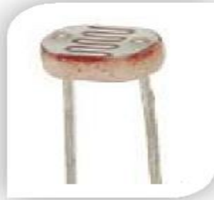
Figure 2.3 Light Dependent Resistors

Two cadmium supplied photoconductive cells with spectral responses similar to that of the human eye. The cell resistance falls with increasing light intensity. Applications include smoke detection, automatic lighting control, and batch counting and burglar alarm systems. Figure 2.3 is light dependent resistors. Intensity of the light is varies depends on temperature value.